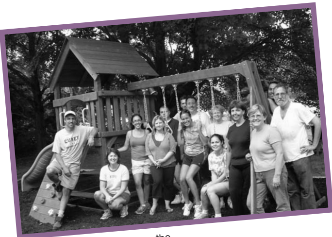
Covidien employees improve the yard and playground at one of our shelters.